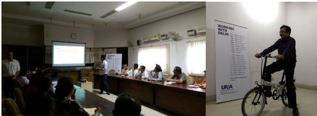
mobility for Dwarka Residents

Sept-Oct 2015: URJA launches the Aap Ki Sadak initiative in Mehrauli, New Friends colony, CR Park, and GK 2 and brings Architects, Transport experts and RWA plus local residents to brainstorm on solutions to resign and fix local streets without conflict and with community and Government participation